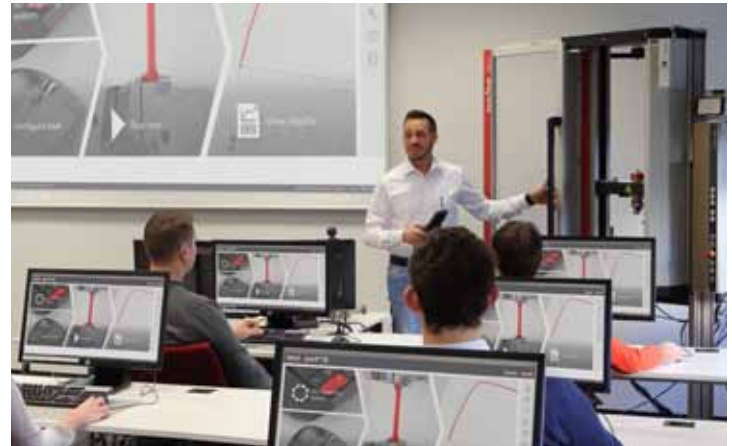
Small teaching groups provide optimum learning conditions