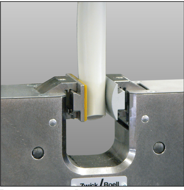
Type 8297 pneumatic grips, Fmax 2.5 kN, jaw height 30 mm

The specimen grip is opened and closed via buttons on the testing machine. The optional foot pedal unit or machine remote control can be used for additional operating convenience.