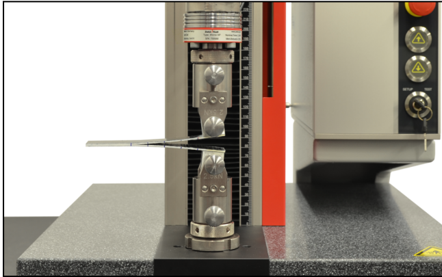
Fixture for G_{1C} tests on long-fiber-reinforced composites